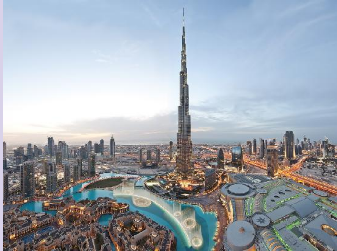
Dubai, United Arab Emirates