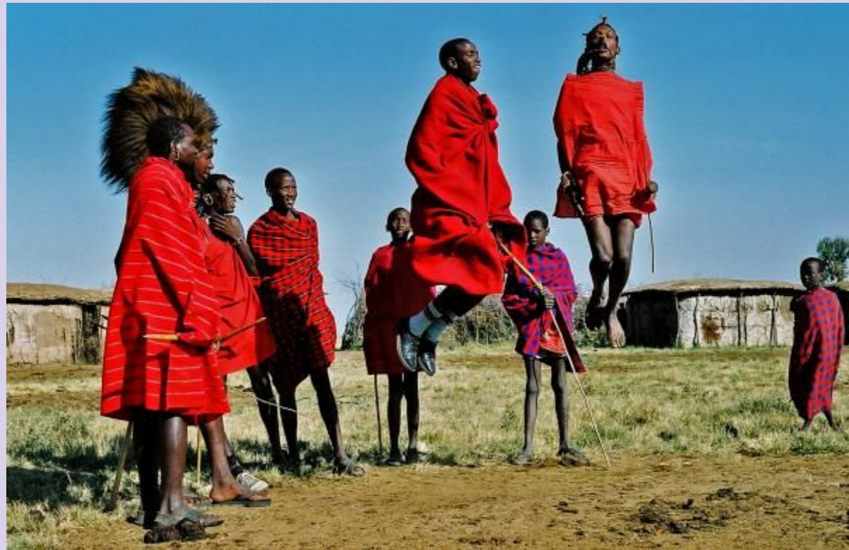
Maasai people, Kenya